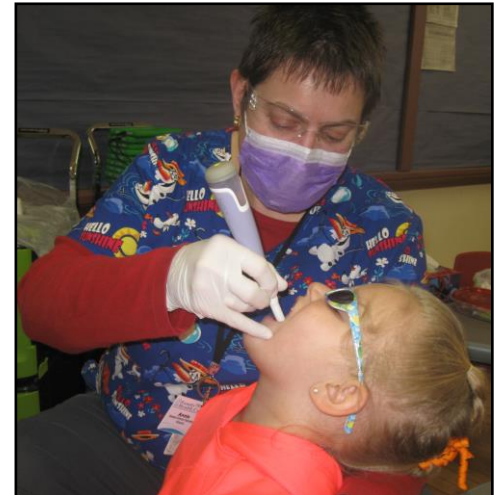
Above: Dental health starts early! Family Health Care providing dental exam services at a FiveCAP Head Start Center.