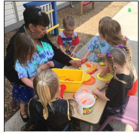
Pictured: Head Start children at the Robert F. Williams Center enjoying an outdoor activity on a warm Spring day.