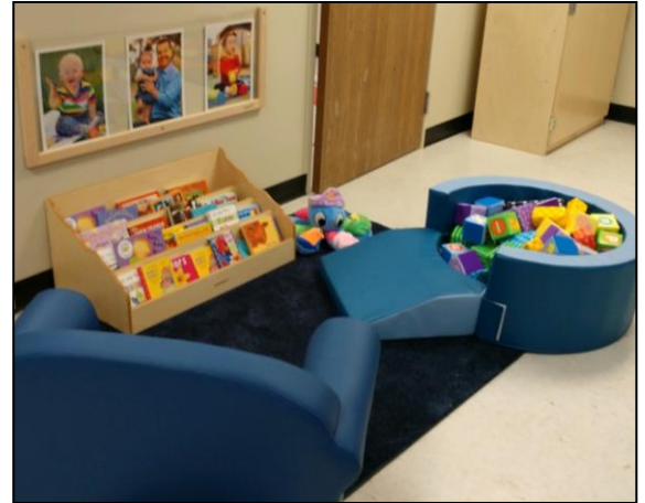
Pictured: Early Head Start classrooms set up and ready.